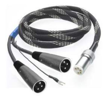
Connect it Phono DS 5P/XLR: separately available upgrade cable for True Balanced phono connections