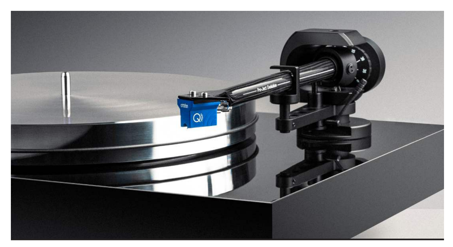
PRO-JECT AUDIO SYSTEMS www.project-audio.com

The major differences to the Xtension 9 and 10 are found in the top of the main platter and the magnetic feet. Instead of the glued-on vinyl top on the platter we went back to the use of slip mats. The X8 comes with our standard felt mat. On the Xtension 9 and 10 you cannot really play around with using different mats due to the vinyl top. This customizability comes back on the X8 and offers a few more options to tailor the sound to your liking.