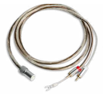
Connect it Phono E 5P/RCA included: Semi-balanced premium phono cable