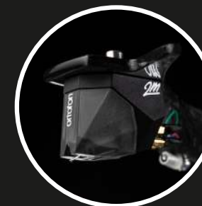
Cartridge: Pick it 2M Silver