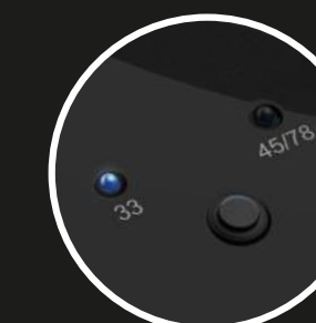
Electronic Speed Change