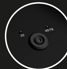
Electronic Speed Change