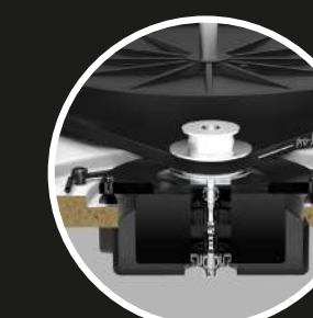
Silicon-damped Motor Suspension