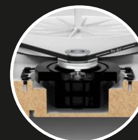
Superb motor suspension: no points of contact