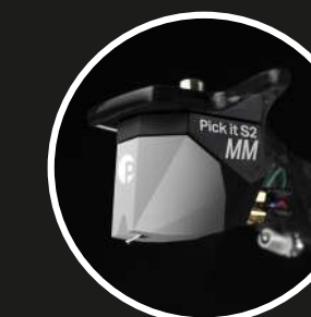
Cartridge: Pick it S2 MM