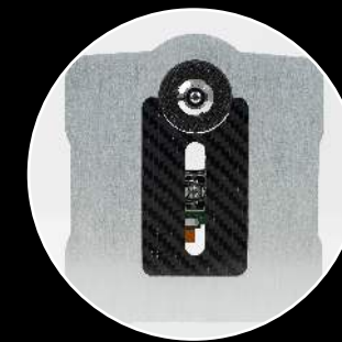
High-tech CD-Pro 8 drive in 1-piece aluminium chassis