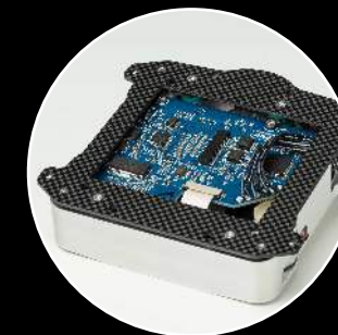
Carbon fibre suspension plate and CD-87 servo system