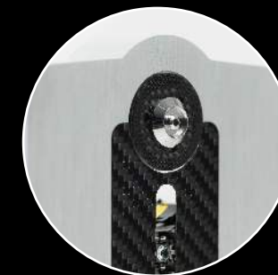
Carbon fibre CD turntable with magnetic puck