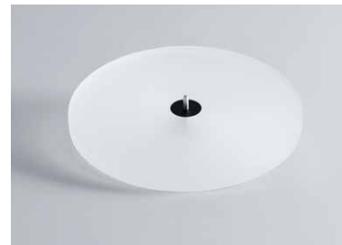
Acoustically neutral high-mass acrylic platter