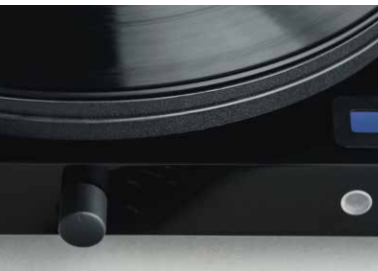
Platter: 300 mm incl. felt mat