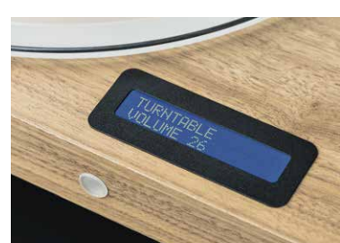
Built-in high-contrast display