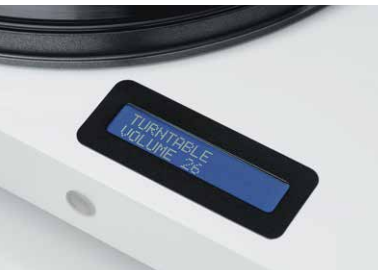
Built-in high-contrast display