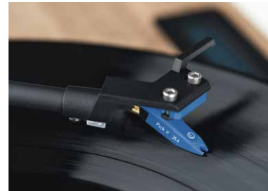
Cartridge: Pick-it 25 A