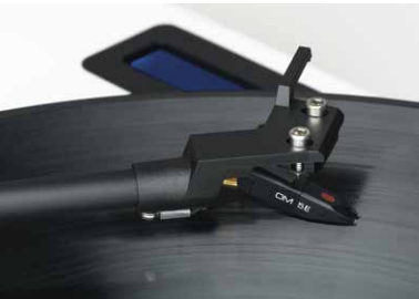
Cartridge: Ortofon OM5E